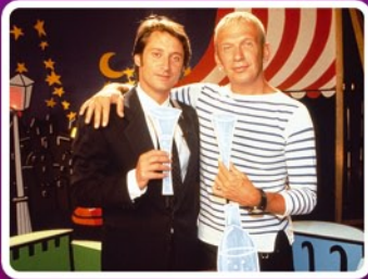
Jean-Paul Gaultier and Antoine de Caunes present the UK version of Eurotrash